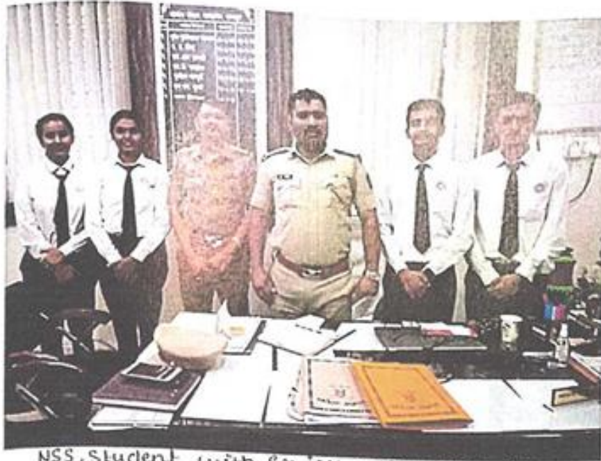
NSS student with Senior Police Officer [Ganeshpeth Police Station]