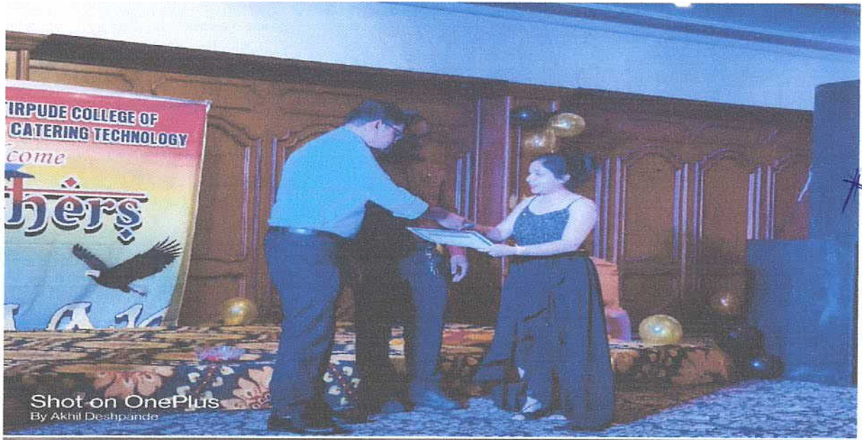
Shot on OnePlus By Akhil Deshpande