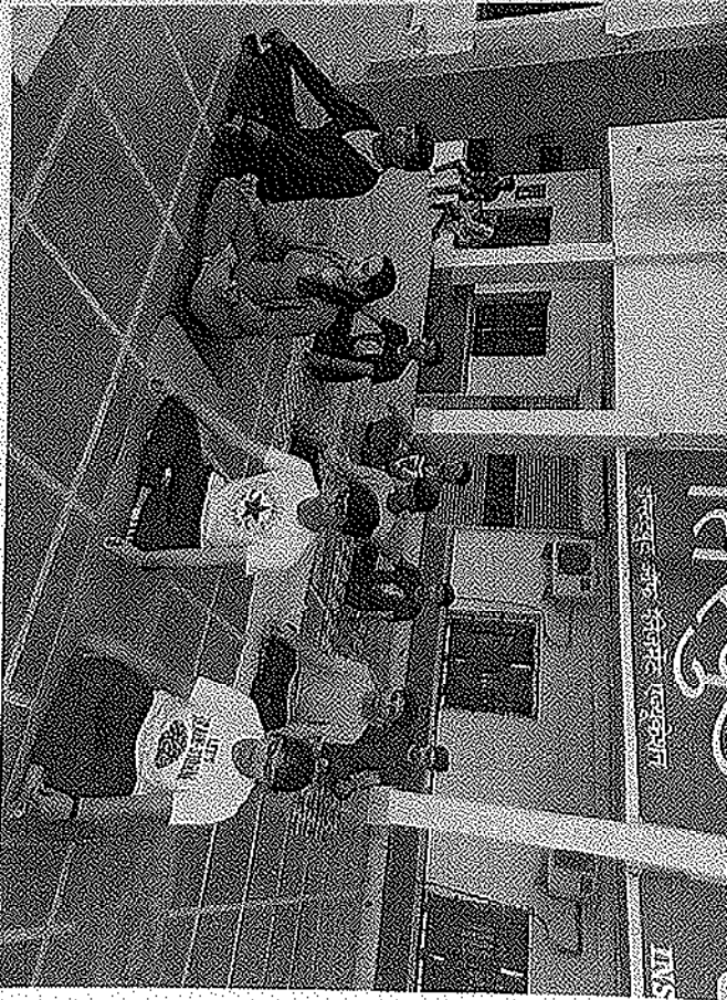
NSS Students performing Ndrin on the occasion of World Health Day, 2022.

OFFICIATING PRINCIPAL Shri Balasaheb Tirpude College of Hotel Management & Catering Technology, Nagpur