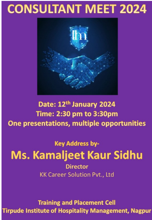
Photo for consultant meet 2024- KK Career Solution Pvt. Ltd. On 12 th January 2024 as per the MOU 2023

(Approved by AICTE, New Delhi, Govt. of India, Govt. of Maharashtra & Nagpur University, Nagpur) 1, Shri Balasaheb Tirpude Marg, Civil Lines, Sadar, Nagpur - 440001 Phone (Off.) : +91 712 2550695, 2550032 Email : tirpudehmct@gmail.com Visit us at - www.tirpudehmct.ac.in AICTE Permanent Institute Id : 1-14318331 • DTE Institute Code : HM4219 • RTM College Code - 007 AISHE Code : C-18976